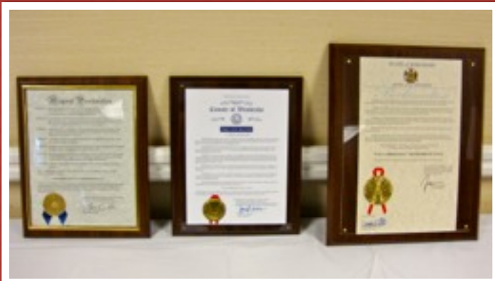
Our three proclamations-city, county & state