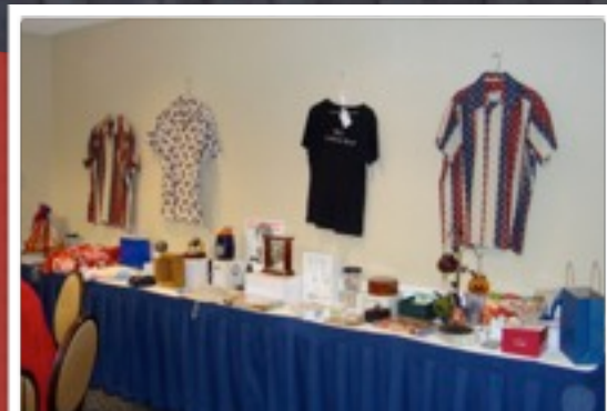
Our Raffle Items in which we made $495.00 >