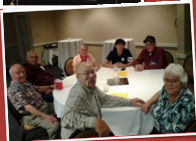
Catching up with old friends!