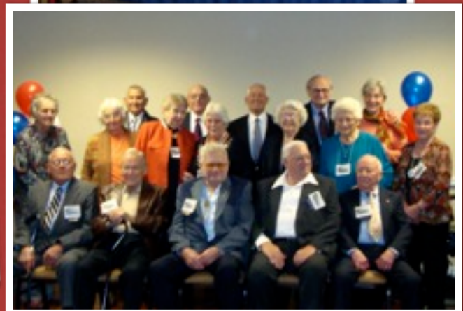
Survivors, spouses and partners