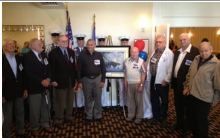
Survivors at the 2012 Reunion in Milwaukee after the memorial svc.