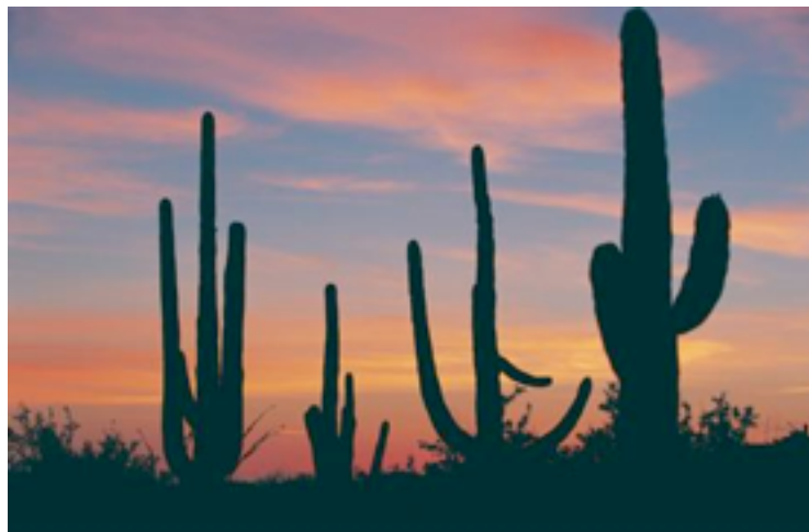
80E 877 Saguaro with Sunset