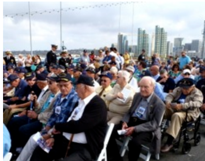
Below on are some of the hats worn by the 55 survivors who attended the reunion