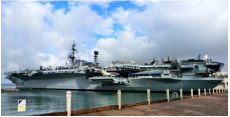
^ USS Midway