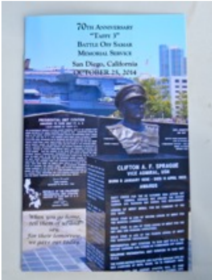
<Our Memorial Service program