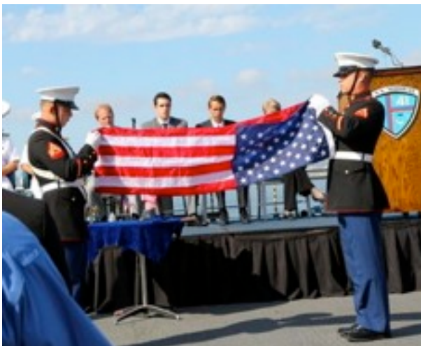
THE HONOR GUARD DOING THE FLAG FOLDING CEREMONY.