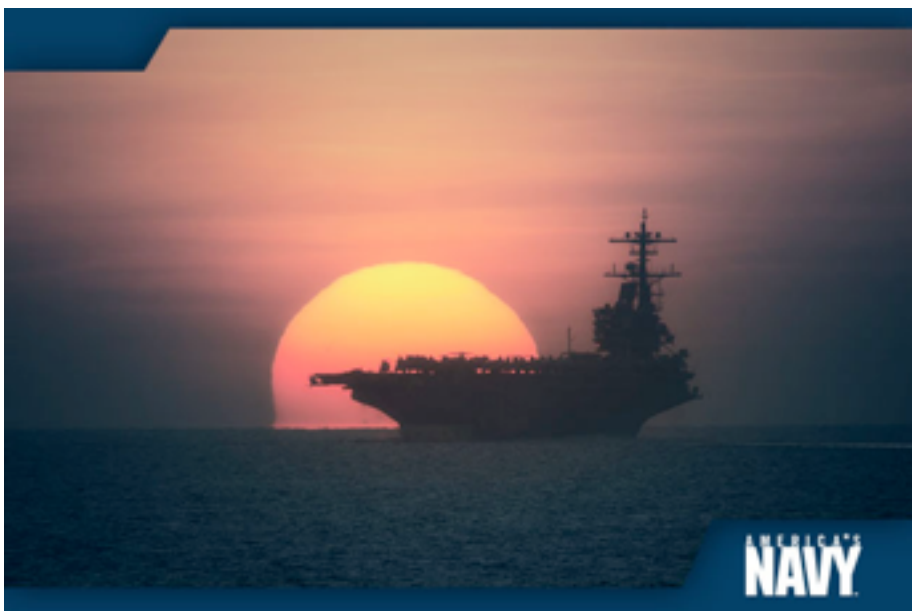
USS George H. W. BUSH