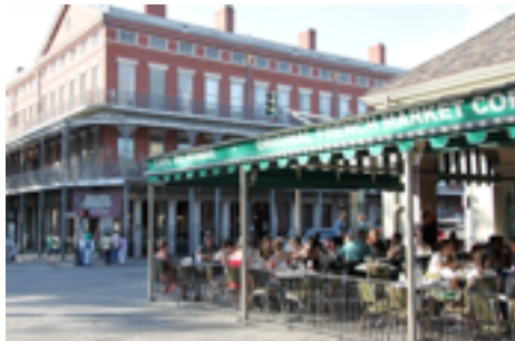
Cafe Du Monde

You might like to take a food tour, cemetery tour, ghost city tour or check out the French Quarter day or night.